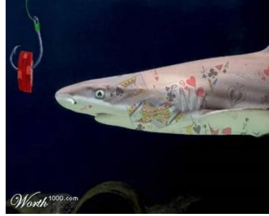
3. Card shark