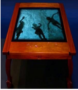
1. Pool (or water) table