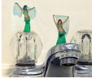
2. Tap dancers