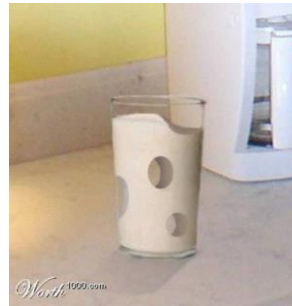
7. Whole milk