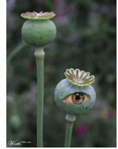
4. iPod (iPad accepted)