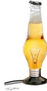
8. Light beer