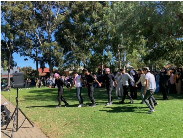
Lebanese young men a