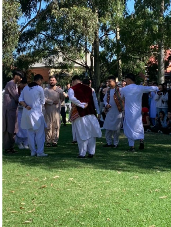
Afghanistan young men