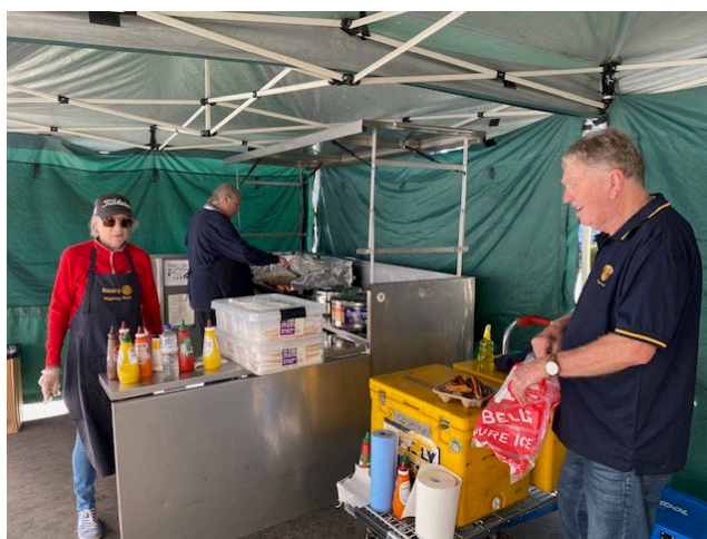
Bunnings BBQ am team hard at work.